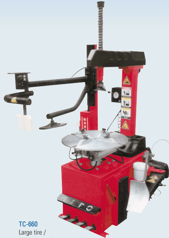
TC-660 Large tire / fully automatic / single arm / tilt back

HANDLES TIRES TO 41" DIAMETER AND RIM WIDTHS TO 16". ASSIST ARM FOR CHANGING STIFF LOW-PROFILE TIRES. TILTING COLUMN AND PNEUMATIC LOCKING SYSTEM.